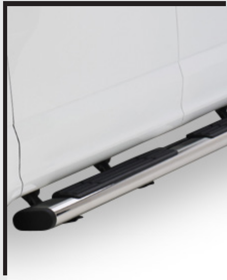
$25 eRewards OE Xtreme Composite 5" Side Steps