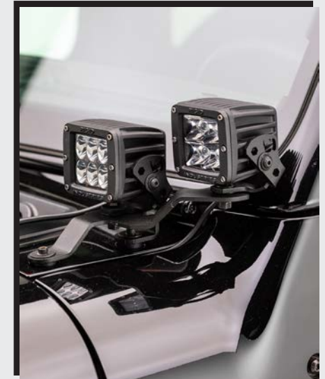
$10 eRewards Light Mounts for Jeep