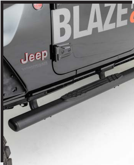
$25 eRewards 1000 Series 4" or 5" Side Steps