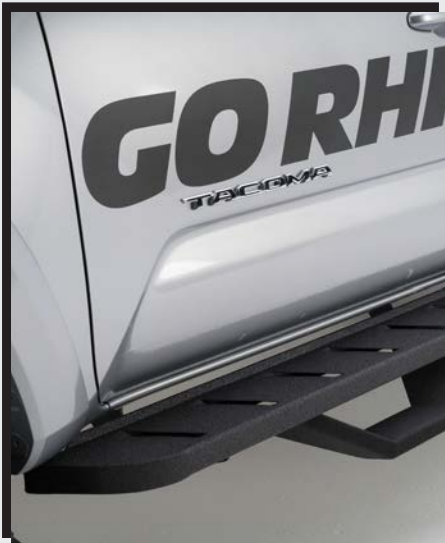
$50 eRewards RB10 Running Boards with drop steps