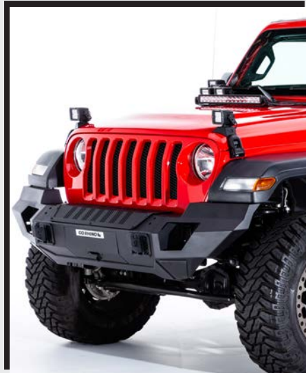
$50 eRewards Jeep Trailline Front Bumpers