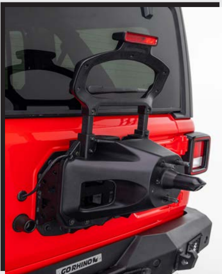
$25 eRewards Jeep Spare Tire Relocator Kit