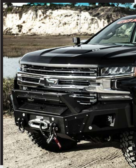
$125 eRewards BR Series Truck Front Bumpers