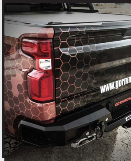
$75 eRewards BR Series Truck Rear Bumpers