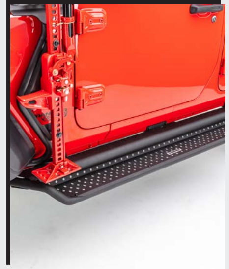
$50 eRewards D1 Side Step for Truck or Jeep