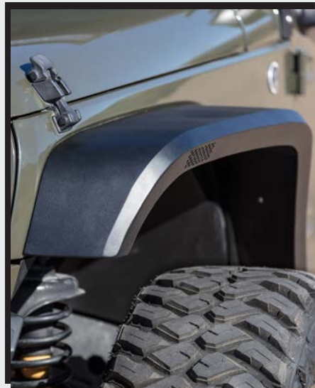
$50 eRewards Jeep Fenders